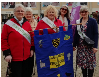
WI members at the Coronation banner parade

We meet at the Parish Room, Richard Jory Playing Field at 7pm on the first Tuesday of the month. Please contact cusgarneandfrogpoolwi@gmail.com for details.